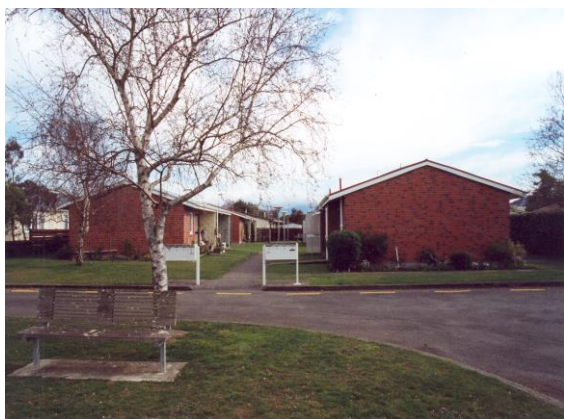
Bodmin Flats 182—184 Chapel Street