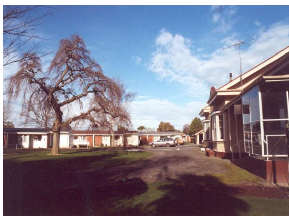
Panama Village 120 Ngaumutawa Road