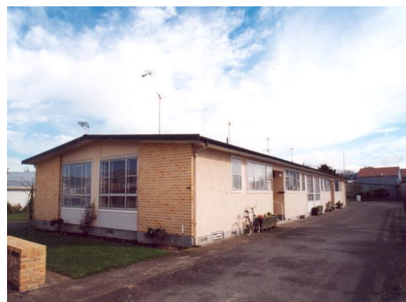
Truro Flats 190 Chapel Street